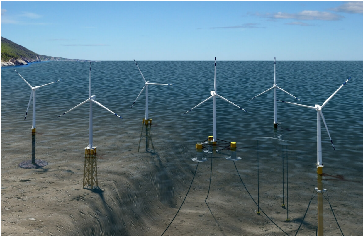
Figure 3. Offshore wind foundation types. Left to right: monopile, jacket, twisted tripod, floating semi-submersible, floating tension leg platform, and floating spar.

While lessons learned from Europe are important, the marine mammals present may differ from those that reside on the US Atlantic coast. The low-frequency great whales have not yet been not considered in Europe given the current location of wind leases, which are mainly North Sea., but instead a short list of cetaceans and phocids were, as listed in Annex II and IV of the European Union’s Habitats Directive, as shown in table 3.